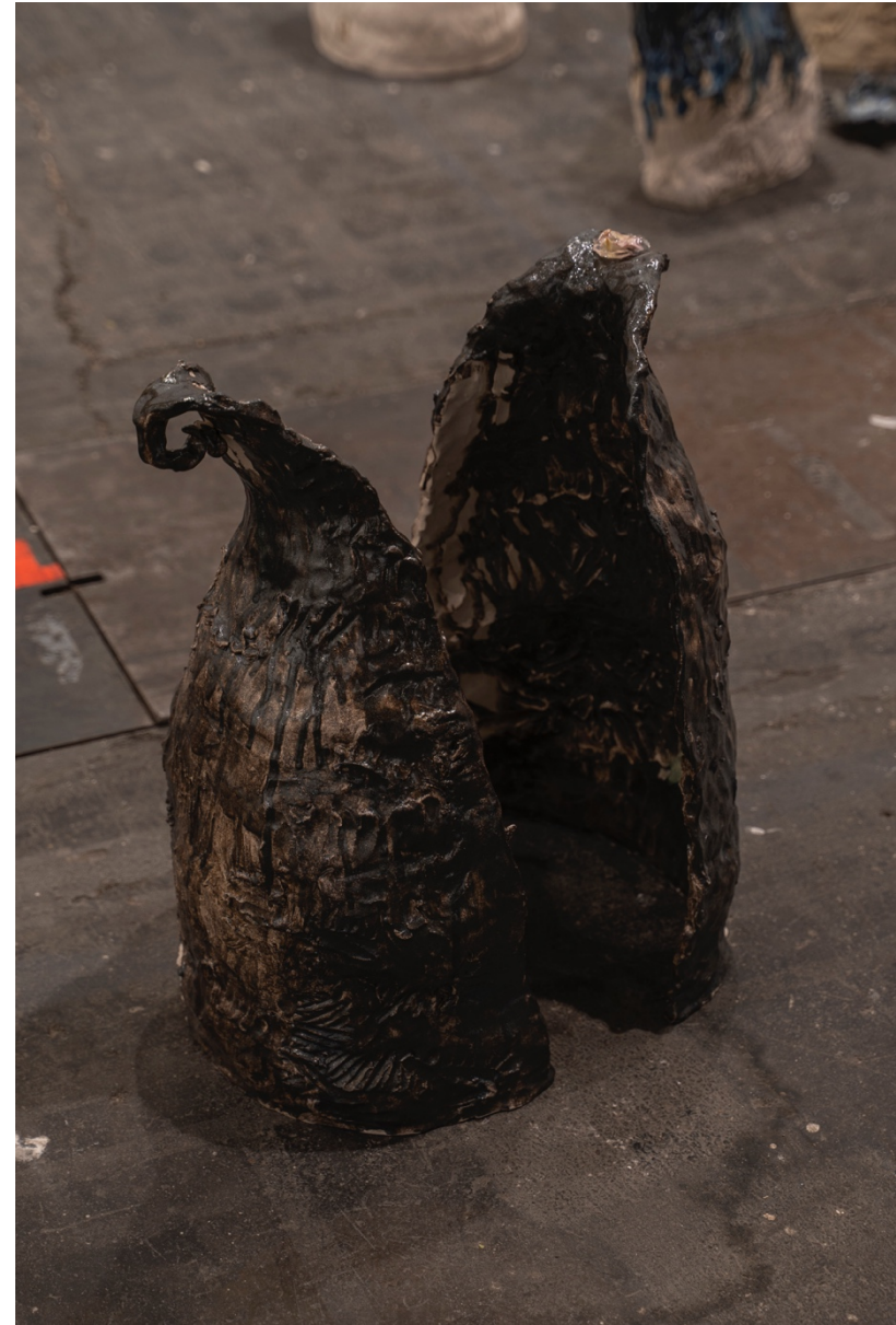
Cáscara , 2024. Ceramics. 80x51x31 cm. Price: 3.000€+TAX