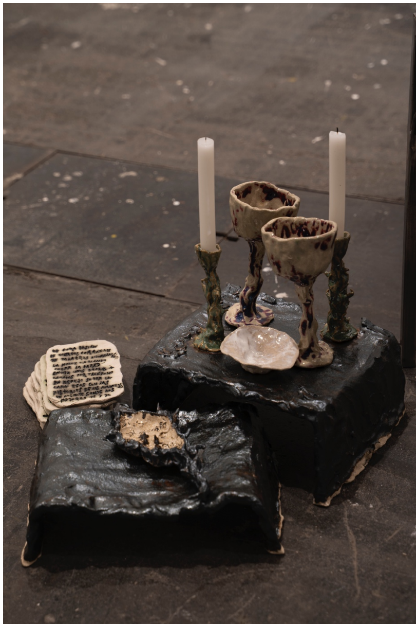
Bodegón I , 2024. Ceramics, 42x30x24 cm. Price: 1.500€+TAX Bodegón II , 2024. Ceramics, 42x30x24 cm. Price: 1.500€+TAX