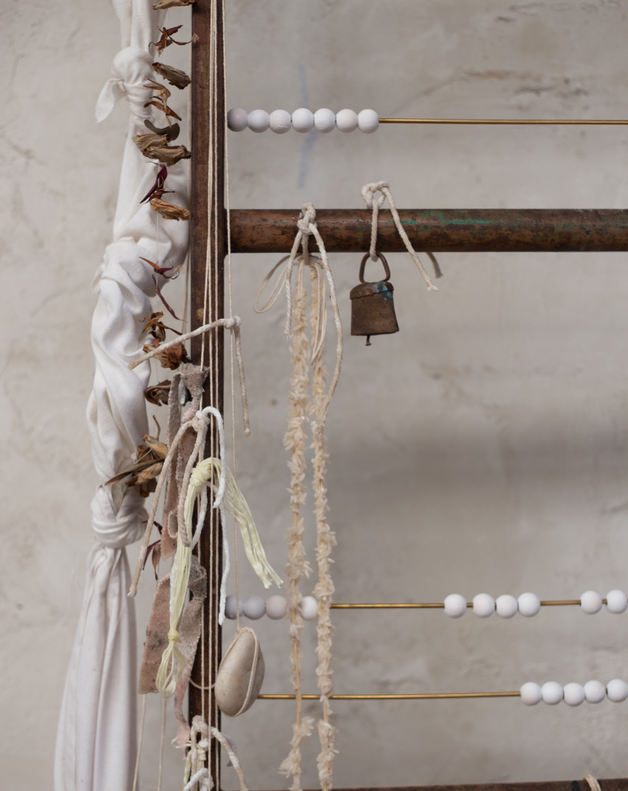
Secadero II, 2025 Ceramics, iron, fabric and paper. 200 x 42 cm. Prices: 5.500€ + IVA