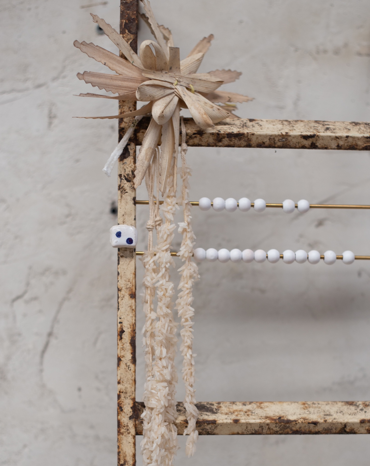
Secadero I , 2025 Ceramics, iron, fabric and paper 111 x 22 cm. Prices: 4.500€ + IVA