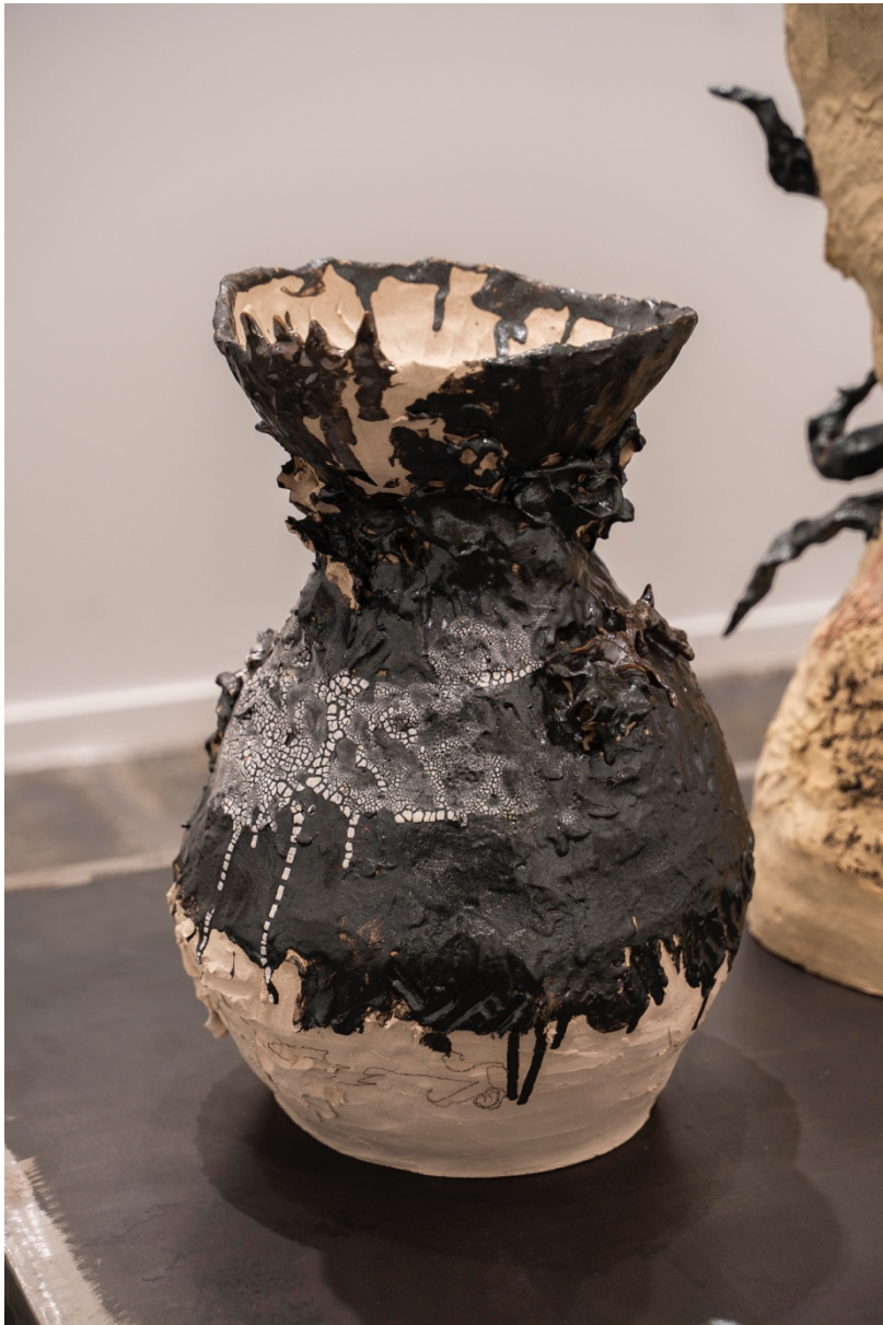
Flor , 2024. Ceramics, 44x28x28 cm. Price: 2.000€+TAX