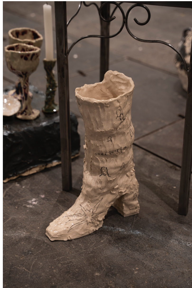
Un sueño cualquiera , 2024. Ceramics, 34x23x12 cm. Price: 1.000€+TAX